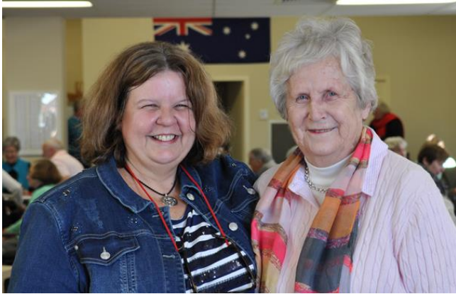
Best Local Pair