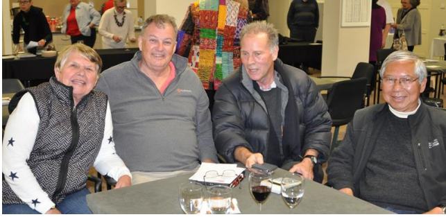
The Kahler Team