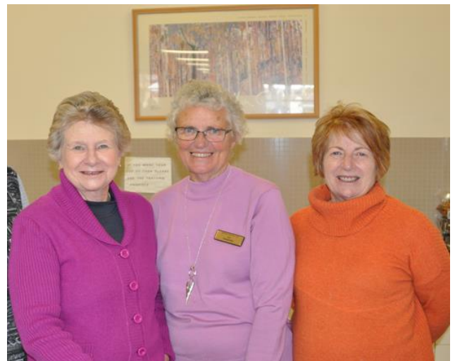
Some of our willing kitchen helpers.

food for morning and afternoon tea. Thank you too to those members who helped in the kitchen and in other ways to keep the Congress running smoothly.